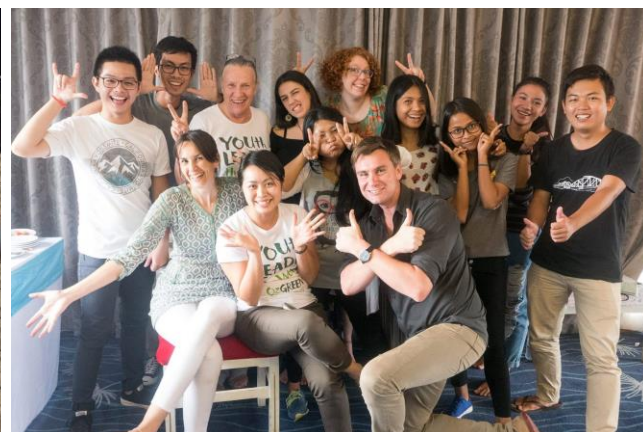
YLTW Facilitator Training Cambodia