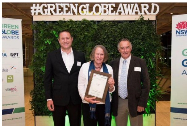
GREEN Globe Award Ceremony, October 2016