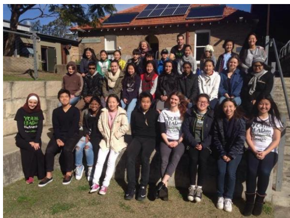
YLTW Congress North Sydney

Participants say the most significant impacts for them are greatly increased understanding of climate change and sustainability, increased motivation, personal confidence and leadership capacity and connections with change-makers locally and globally.