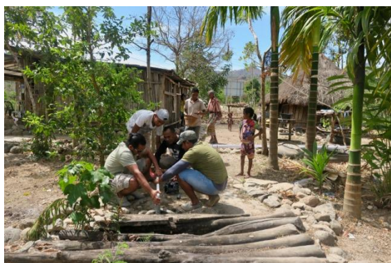
Fixing a broken water pipe

I have several students keen to continue schooling next year so thanks to individual donations they will be able to do so. We also supplied a few piglets as an investment to two families. Other gifts will have to wait until the New year when the roads become passable again.