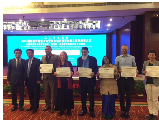
UNESCO Wenhui Award Ceremony in Beijing, November 2016

I would like to extend a special thanks to OzGREEN staff, volunteers, YLTW Facilitators, OzGREEN Board and OzGREEN Fund for the Rivers Board. You have helped us to steady the course as we navigate through a very difficult period.