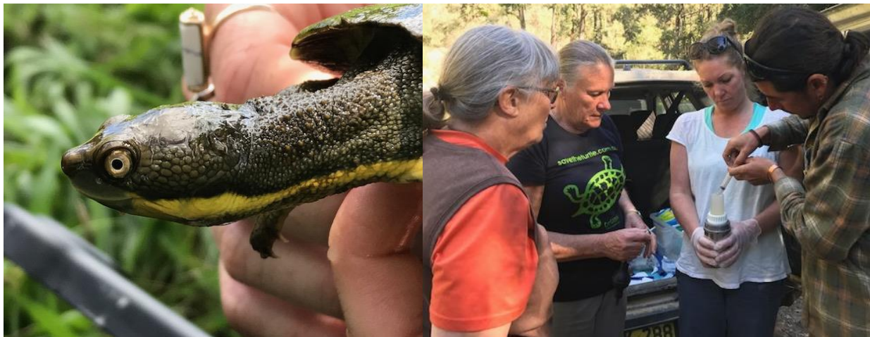
Critically Endangered Bellingen River Turtle

The data gathered is being used to support the recovery of endangered species, including the critically endangered Bellingen River Turtle Myuchelys georgesi . (Cann, 1997). A group of over 38 dedicated community volunteers and 5 local schools monitor riverhealth on the 2 nd Tuesday and Wednesday of the month.