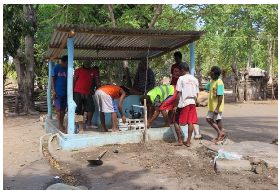
Installing a new water pump