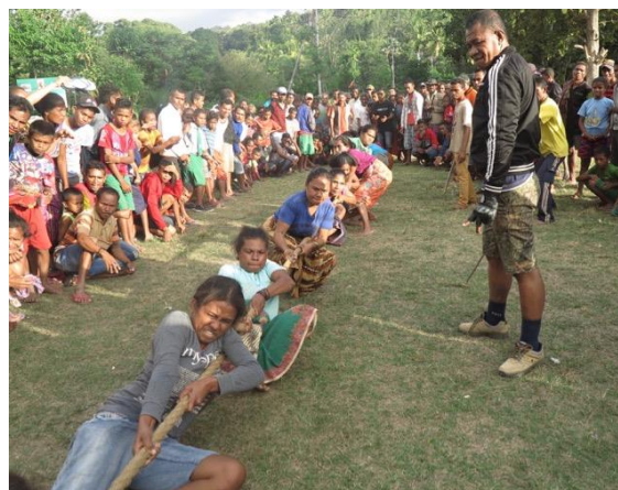
Youth in Action Green Games Tug-of-War