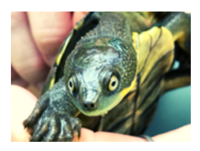
Critically Endangered Bellinger River Turtle Myuchelys georgesi

Bellingen Riverwatch is an initiative of OzGREEN and NSW Government Saving Our Species program working partnership with Bellingen Shire Council, NSW Waterwatch. Western Svdnev University. Taronga Zoo. Bellinger Landcare. Earthwatch Institute, Logical Australia, North Coast Local Land Services, Jaliigirr Biodiversity Alliance and Orama Primary School, Chrysalis Steiner School, Bellingen Primary School, St Mary's Bellingen Primary School, and Bellingen High School.