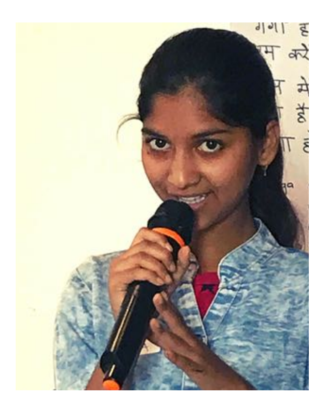
Young village woman speaking about her challenges and ideas for action during YLTW Congress November 2018