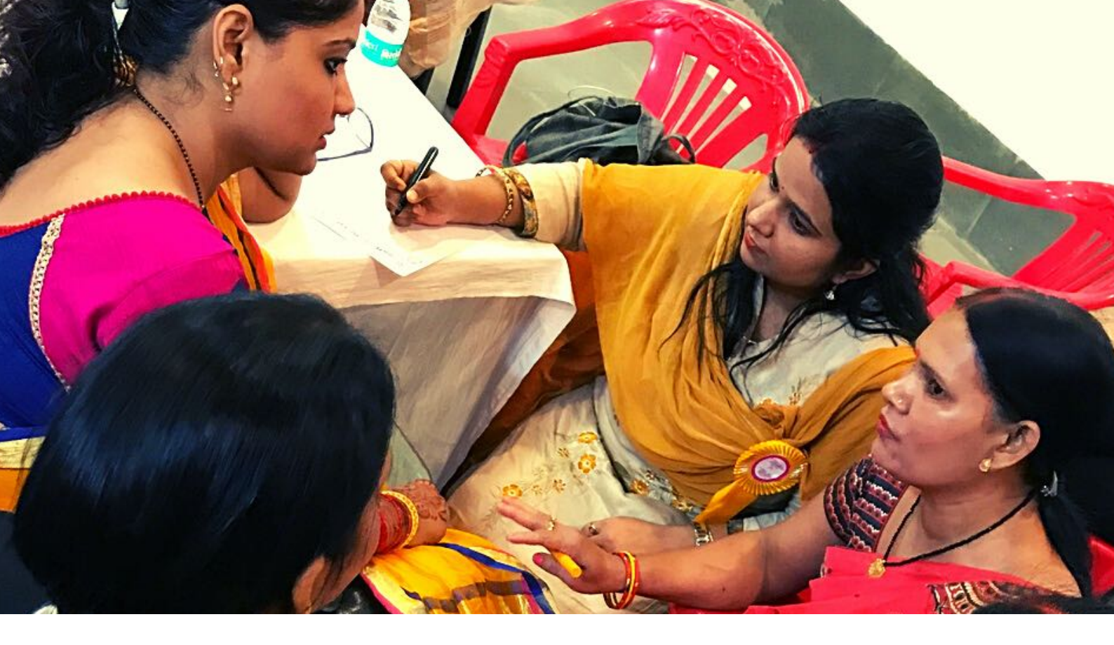
Mothers for Mother group discussing ideas for action